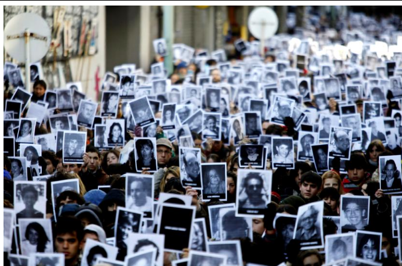
Claims of justice and truth for AMIA victims have been frequent in Buenos Aires during the last 19 years.

The unexpected election of the Argentine Cardinal Jorge Mario Bergoglio, Archbishop of Buenos Aires, as Pope Francis, the first non-European pope in the history, has led to a positive effect on the case.