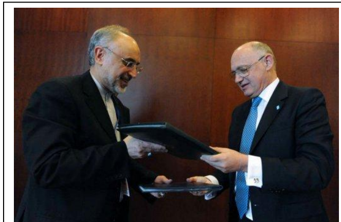
Hector Timerman and Ali Akbar Salehi, Ministers of Foreign Affairs of Argentina and Iran during the MOU's signature, January 27, 2013.

h. The document avoids setting deadlines for the successive steps, and therefore the time of completion of the whole process would be uncertain. 19